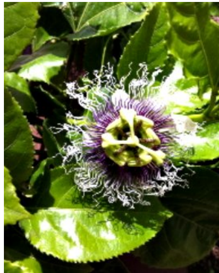
Passionfruit Flower Rhonda, San Diego

We'd love for you to share pictures of what's currently growing in your garden. Please send photos to john@gardenlife.com